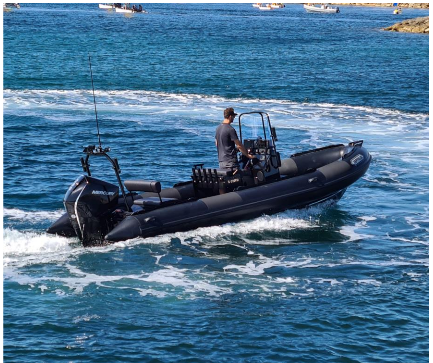
Example of arrangement: Commander 6.70