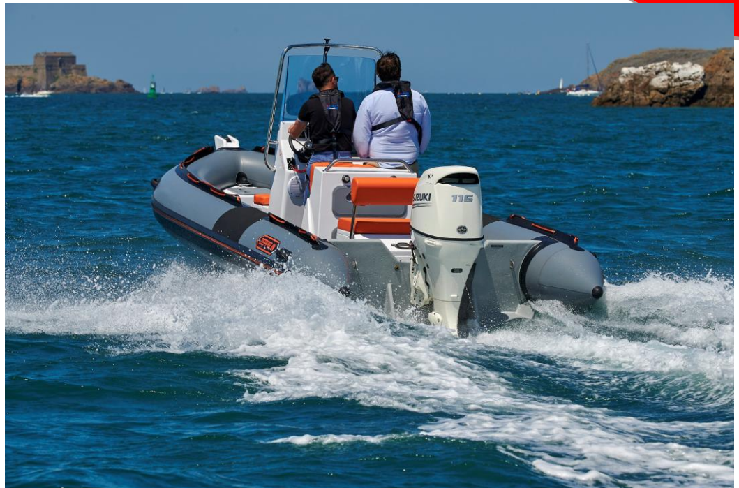
Command 20 VPRO vitamine