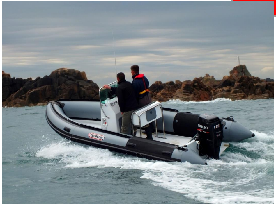
A 18 VPRO realisation