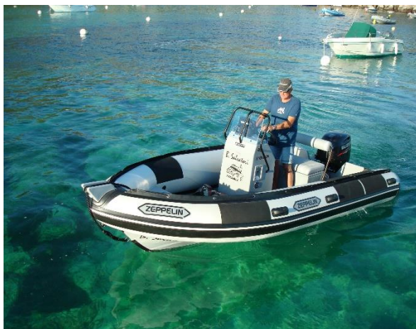
A 16 VPRO realisation