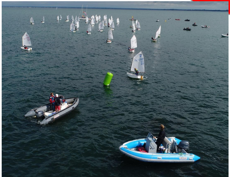
A 15 VPRO realisation